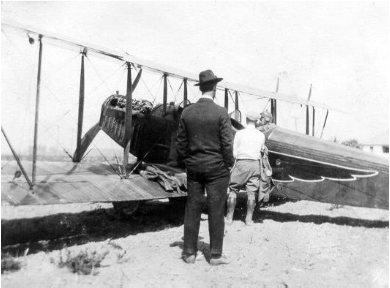
In this picture there is a Curtiss JN-4 "Jenny". It was a war surplus Army trainer plane that could be bought for a very reasonable price.