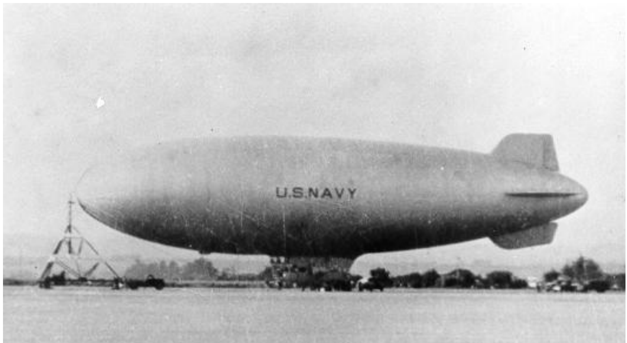
One of the U.S. Navy Blimps used to spot submarines of the coast. It is moored to a platform that can be moved into place by truck.