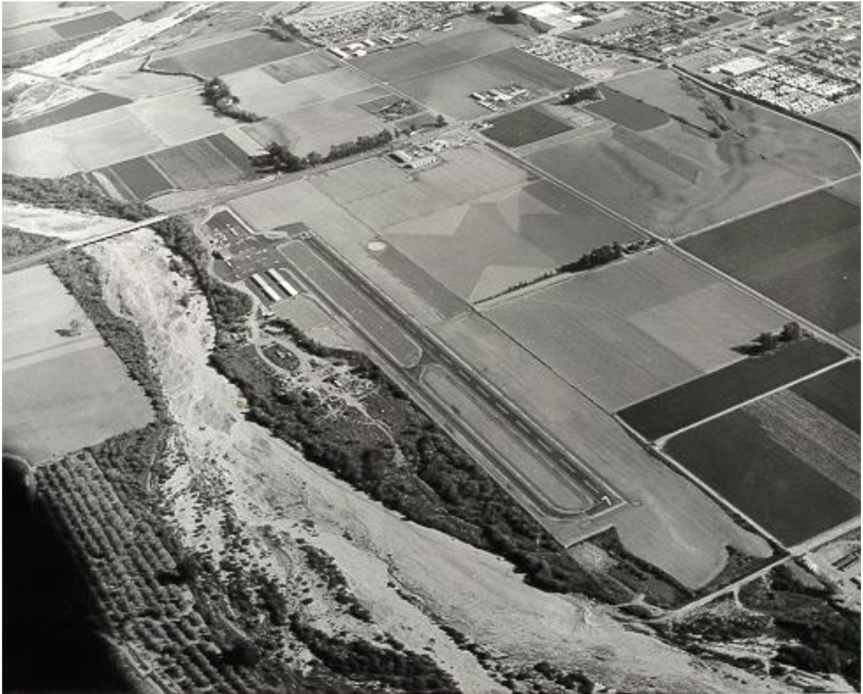
An aerial shot of the new airport taken in 1978. Notice how the town has grown