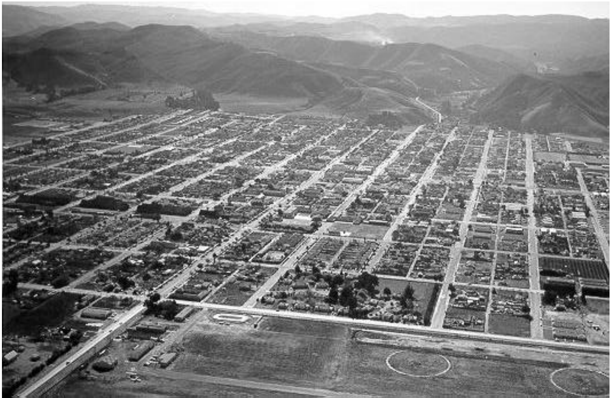
In the air looking Southeast at Lompoc Airport. Note the blimp circles