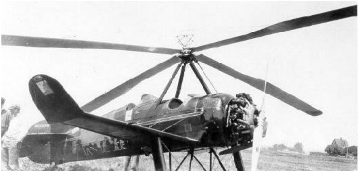
An early Gyrocopter.

The Lompoc Airport was between H St. and O St. and between College Ave. and Pine Ave. until the new one was built in 1960. From 1943 to 1945 the Lompoc Airport was used by the U.S. Navy as a blimp station for spotting submarines of the coast.