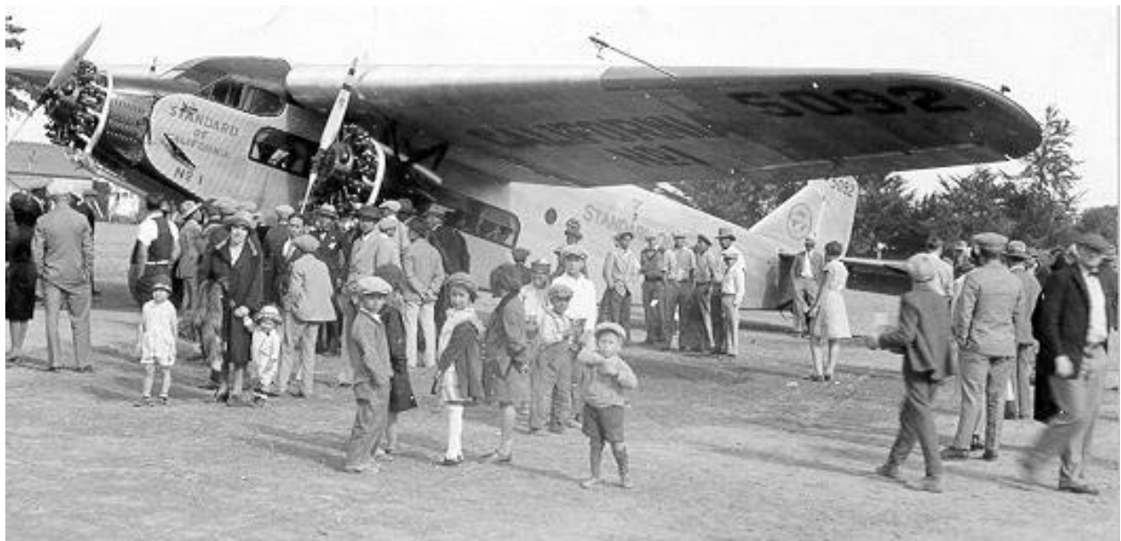
In this picture a Ford Tri-motor present for the dedication of the Airport 1928. The plane was owned by Union Oil Co. and was the biggest plane to land at the Airport up till that time.