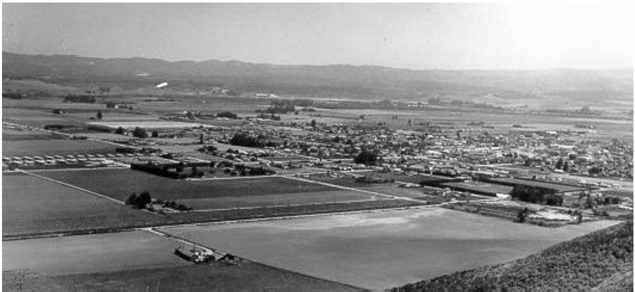
Look close and you can see blimp over Lompoc