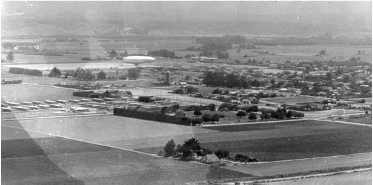
A blimp moored at the Lompoc Airport with Ryan Park in the foreground