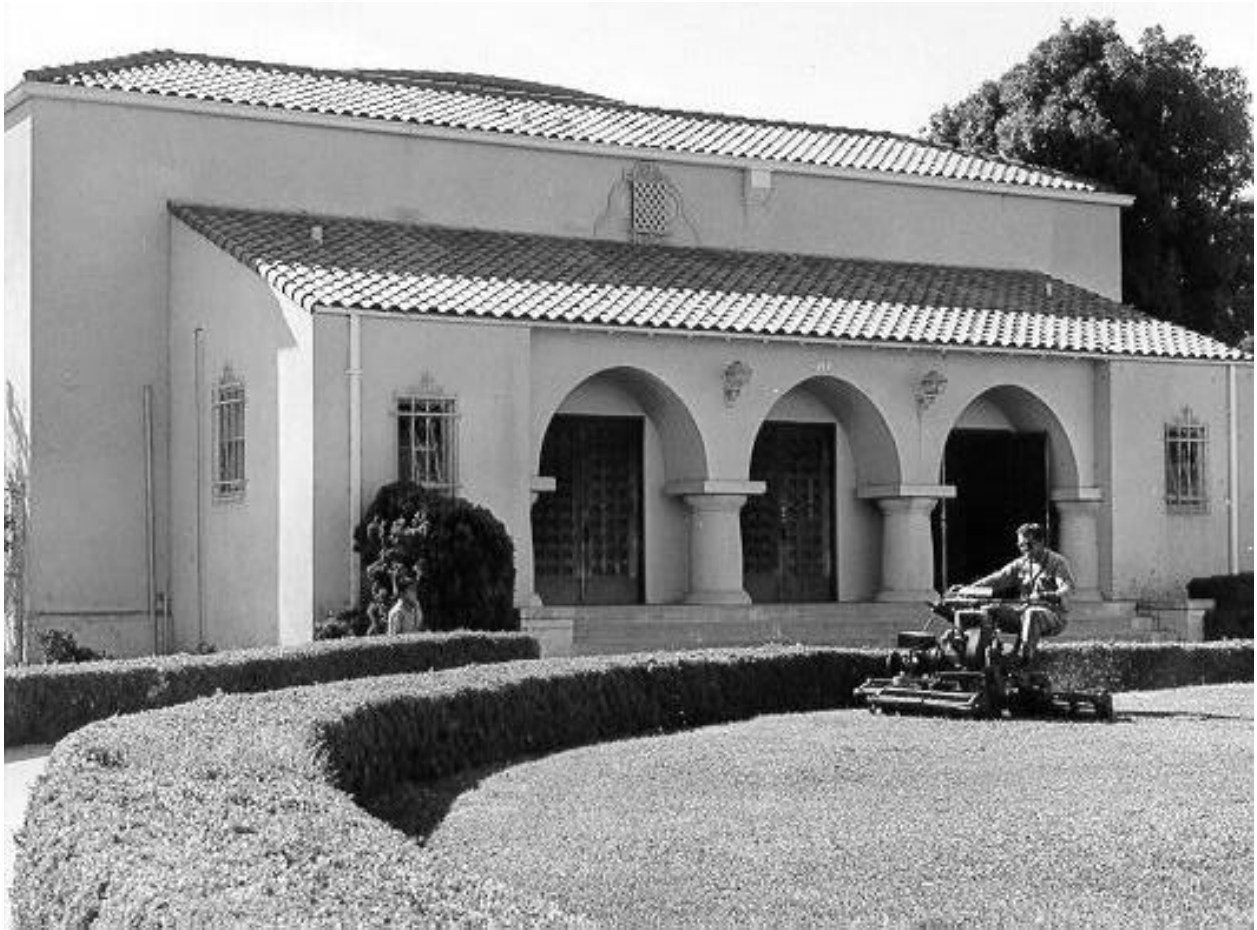
An archive photo of the Civic Auditorium dated 1966, when it was given to the city.