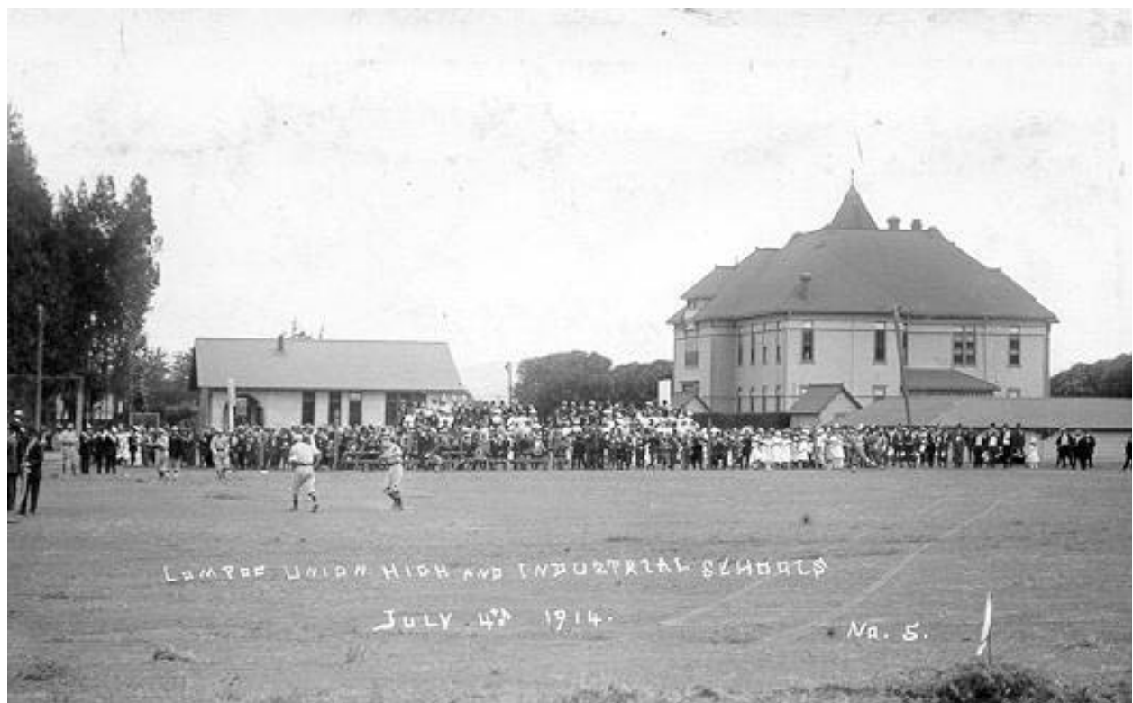
A picture looking North from Olive Ave. at the first Lompoc High School Baseball Field and Industrial Arts Building.