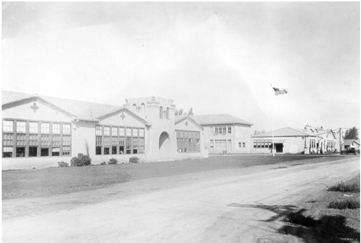
This picture is taken facing Northwest looking from Hickory and "L" St. The Junior High School in the foreground and the High School in the background.