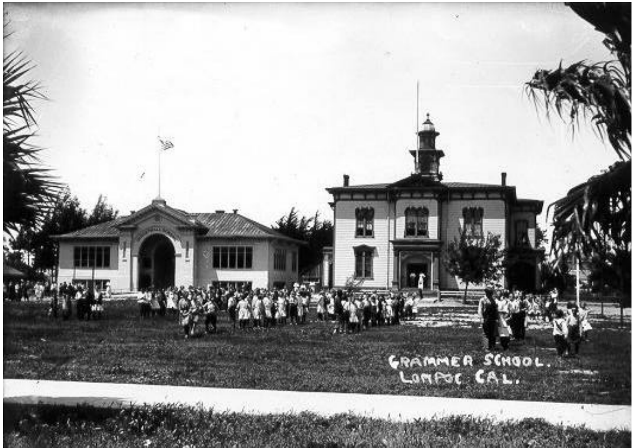
Lompoc Grammar School on the right built in the late 1870's and Industrial School built in 1911.