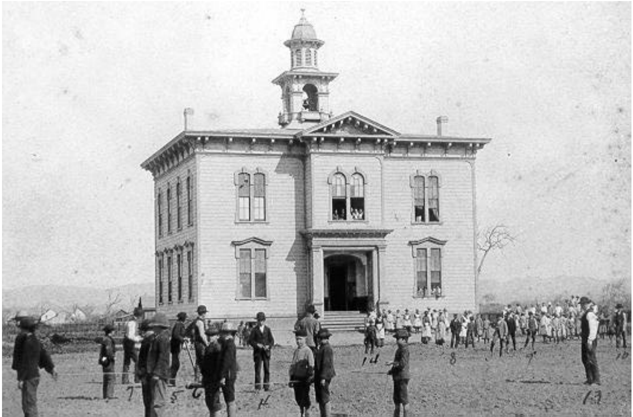
Lompoc Grammar School in 1886. It was built in the late 1870's and demolished in 1922. It was located at Chestnut and "H" St.