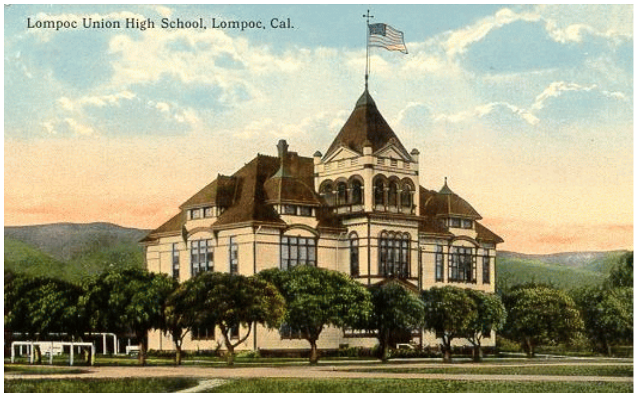
Lompoc Union High School, Lompoc, Cal.