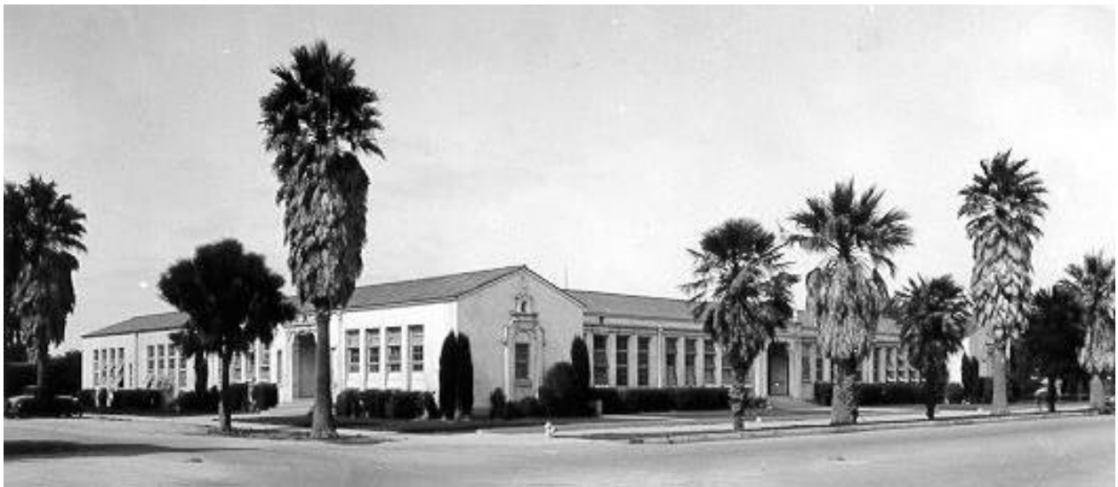
The new Lompoc Grammar School in 1930. It was demolished in 1968 and El Camino School was built. This was also located at "H" St. and Chestnut.